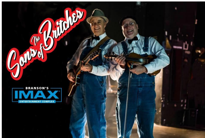
[Special musical guests Sons of Britches]