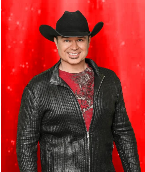
[Special musical guest Clay Cooper]