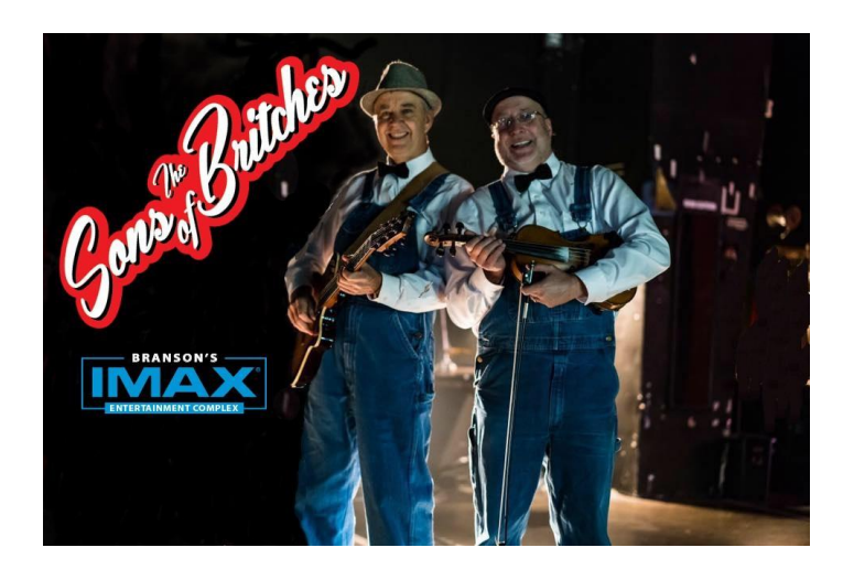
[Special musical guests Sons of Britches]