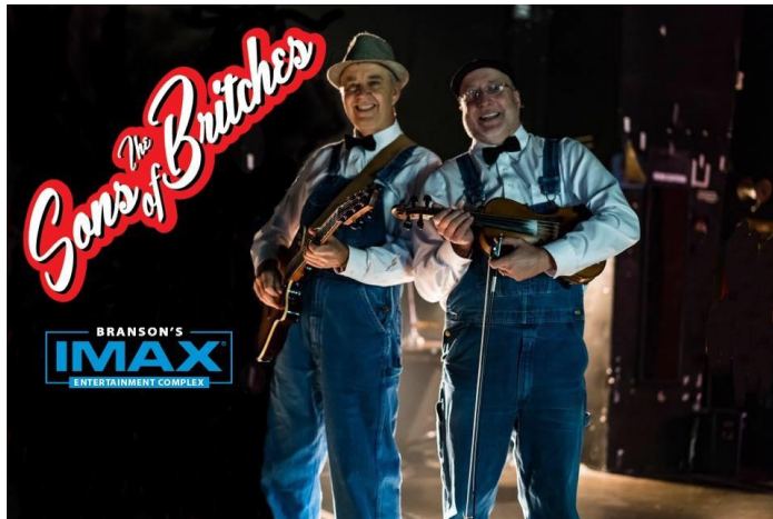
[Special musical guests Sons of Bitches]