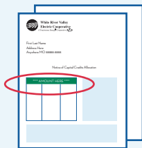
Current members applied to your bill

Capital credits are distributed in two ways. Current members' capital credits are applied toward their bill. Former members, who no longer have a bill where credits can be applied, will receive a check in the mail.