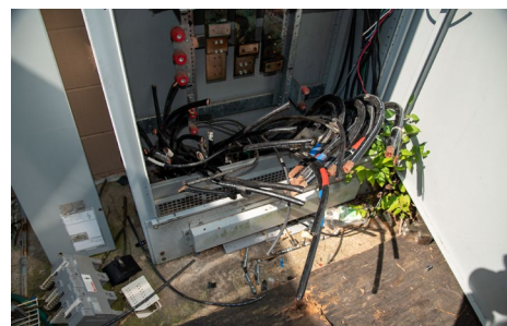
Pictured: Photos from copper theft at RFD Theatre. The theft is estimated to have caused six figures in damages.